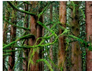
Cedars and Moss —John Turchi

Future Projects: I have purchased my first digital camera, a Nikon 200D and am learning how to use it. Camera RAW is an amazing format. I plan to continue to take photos and market them. I have sold a number of photos, selling for between $100 and $300, depending on size and popularity. At the rate I'm going I will break even by 2020, and then the sky is the limit (Te!He!).