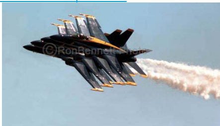
Blue Angels —Ron Bennett